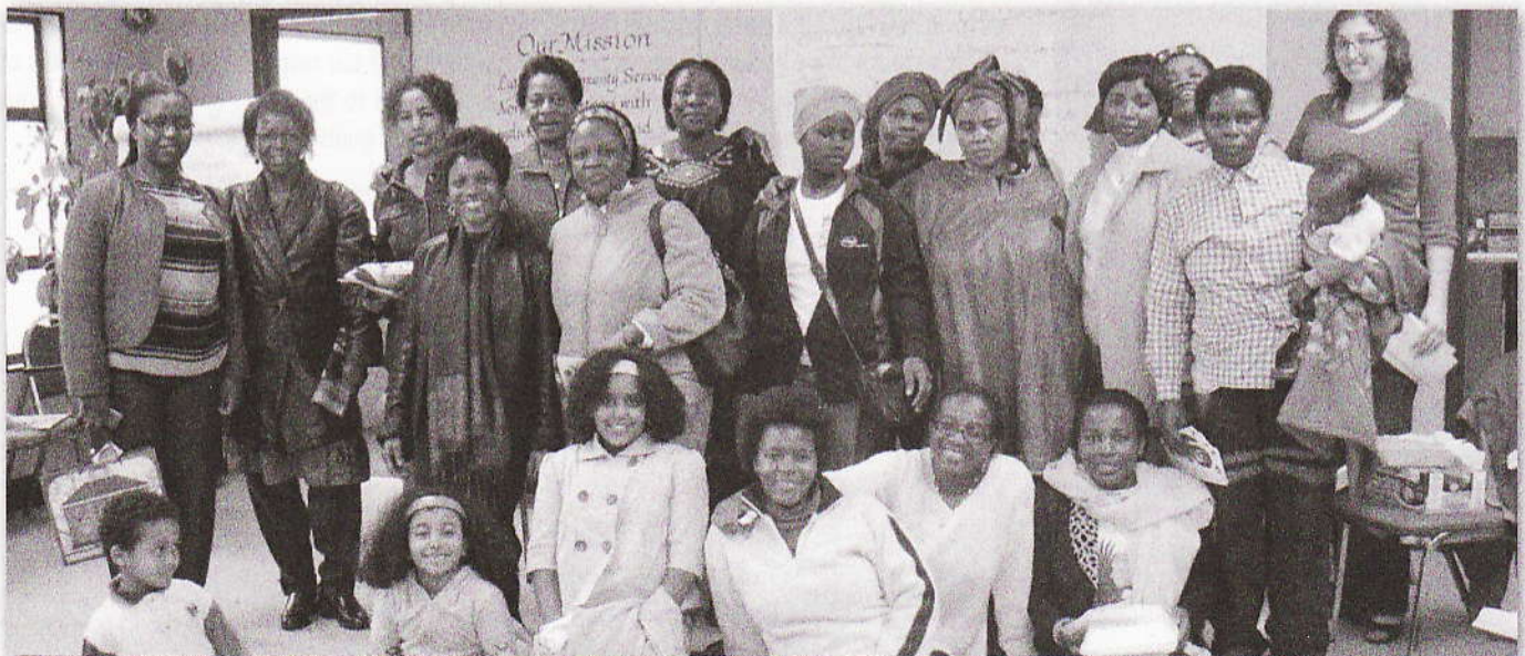
African Women's Coalition membership meeting, February 2008.